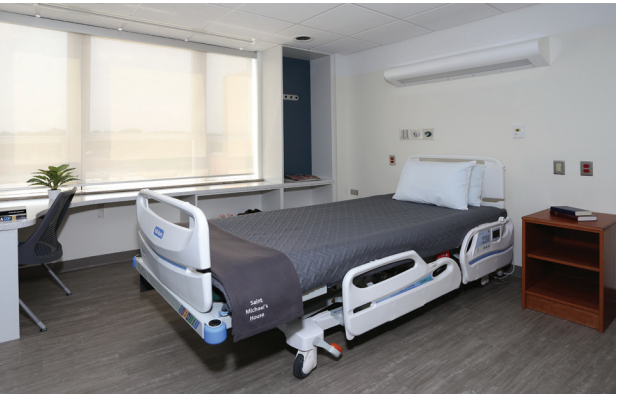
Medical Detox In-Patient Room