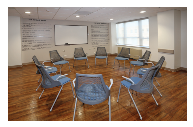
In-Patient Group Room