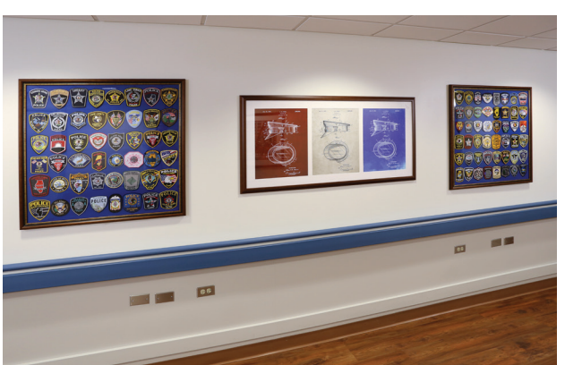
Hall of Honor