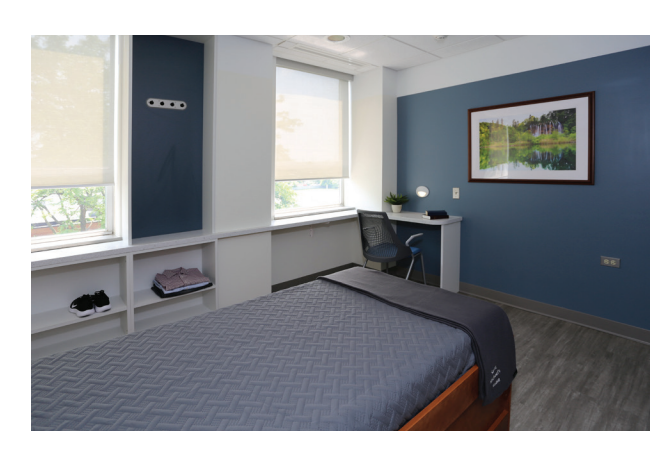
Residential In-Patient Room