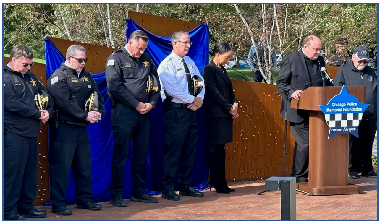
On 11 OCT, we dedicated a new memorial sculpture at Gold Star Families Memorial and Park, honoring CPD's beloved fallen canine and equine members.